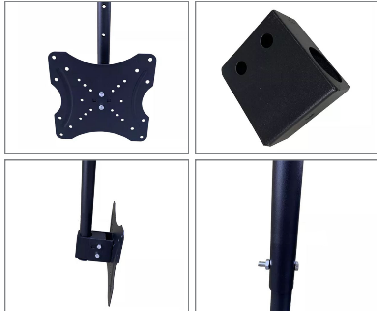
Durable powder coated universal ceiling pole mount bracket, supports VESA™ up to 200x200mm

30398 Esperanza, Rancho Santa Margarita, CA 92688